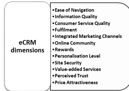
Fig. 1. Twelve Dimensions of eCRM.

Successful customer relationship management is an important competitive advantage that companies can exploit to prevent consumers from switching to a competitor's company. The need for major effective eCRM implementation is intensified in the e-business environment since customer satisfaction and loyalty are much more difficult to establish in the highly competitive nature of the hotel industry market. Hence, understanding the dynamics of eCRM and assessing its impact on companies' outcomes are crucial [13], especially in the service industry. A study by [14] also proposed the 12 dimension of eCRM for the retail business's website, which can be seen in Fig. 1.