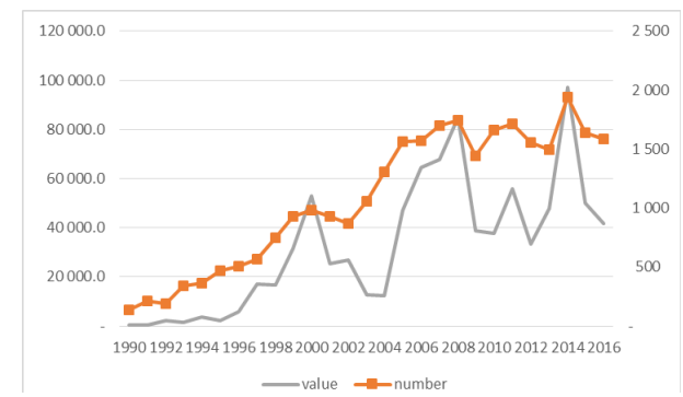
Fig. 1. Number and value of cross-border M&As of seller in Asia.

2008-2016 the amount and number of M&A in Asia show a great volatility, the sample of 11 countries or regions selected by this paper shows the same trend. The transaction amount and number of M&A would be affected by many uncertainties in the world, such as geopolitical changes, regulation becoming increasingly stringent and so on, and the percentage of China in deals of Asian M&A is relatively large, so it is also related to China's economic downward pressure. Therefore, the relationship between cross-border M&A and economic growth includes many intermediate factors, which cause inconsistent trends of two variables.