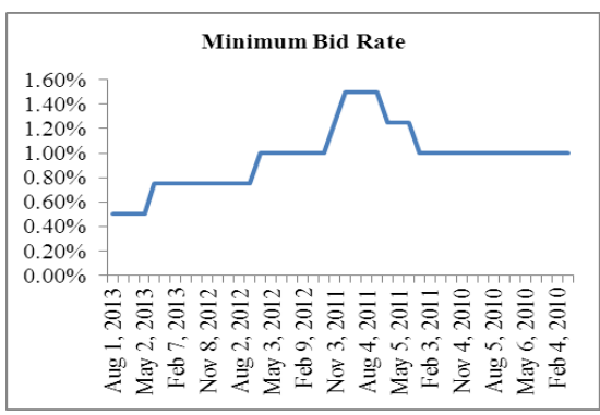
Fig. 1. Trend of minimum bid rate.

charged which is the main source of liquid cash to the banking sector of the region. The rate is considered to have a significant impact causing movement in the financial markets. However, the Minimum Bid rate is also dominated by the ECB press conference held 45 minutes later on the same day. This rate is also announced on the first Thursday of every month, 45 minutes post the announcement of the Official bank rate of GDP. Thus, it is announced monthly on first Thursday at 6.45am for the first 7 months of the financial year starting from April month and at 7.45am for the next 5 months from November month to March [12]. It is observed from the data and the trend depicted below in Fig. 1 that the Minimum Bid Rate has been decreasing since 2011, October. It has initially seen an increase from 2010 to 2011 but after October 2011, it has been constantly decreasing after every few months. The current bid rate is observed to be at 0.5% equals to the Official Bank rate of GBP. The effect of the stock market prices is explained in the below section on the basis of impact of EUR/ USD exchange rate variations.